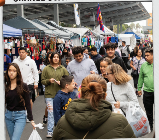
QUALITY TIME/ With something for everyone, the whole family can save money on essentials, food or just browse