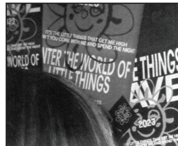
Little Things EP Jorja Smith

After a two-year hiatus from her album Be Right Back and single "Nobody But You" in 2021 R&B singer Jorja Smith returns with a new EP and two earthy singles "Try Me" and "Little Things." The Little Things EP is fast-paced and experiments with more sounds outside of her usual influences like Dua Lipa's album Future Nostalgia . Smith's music has changed just as the song "Try Me" implies, Smith's EP is a reclamation of her self-assurance as a musician. It is the things that get us high off her romantic and dreamy vocals.