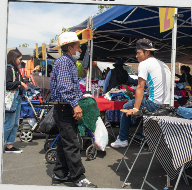
COMMUNITY/ Familiar faces blossom friendships as people browse through two dollar clothing tables