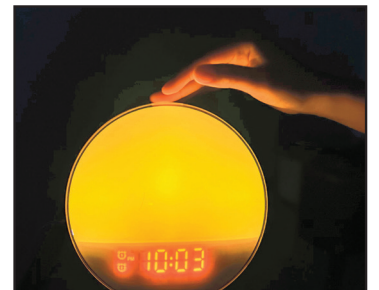
Sunrise Alarm Clock Hatch

The viral sunrise alarm clock you've seen on TikTok is definitely worth it. It mimics the sunrise and allows you to wake up gently with light. The device is easy to set up and lets users enhance the level of brightness desired along with different color lights. The sunlight in the alarm clock gradually gets louder and brighter ten minutes before the sound goes on. This clock helps create a more pleasant way to awaken by promoting better quality sleep and eliminating the startling nature of regular alarm clocks.