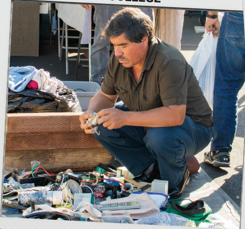
DIG IN/ Many vendors lay out their items on a tarp for customers to look through themselves and ask for prices