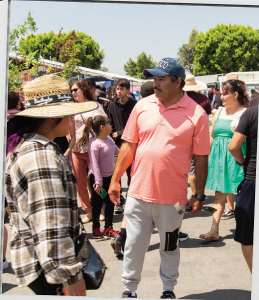
OPEN AIR/ Crowds walk through rows of vendors with easy-ups for shade in hot sun