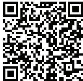
Summer Lovin' 23 from the el Don fam

Are you ready for Summer? Well, we certainly are! It's time to go to the beach, go hiking, sleep in, and relax (until next semester starts, anyway). Time to crack open a beer and spend time with your friends and family. Out with the old, and end with the new. The time for new music or nostalgic sunny tunes is now here. So sit back relax and listen to our latest and spunkiest Spotify playlist yet. Our list includes artists such as Sublime, Tyler the Creator, TV Girl, Donna Summer, SZA, Jay Z, and other 2010's music. Pre-pandemic nostalgia.