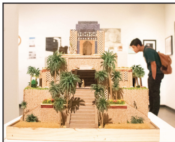
Student Art Show Through June 7

The annual student art show returns to celebrate pieces made by students in photography, digital media, wood, ceramics, sculptures and drawing/painting classes. Some of the most notable pieces at the artshow include a Mexican spinning top, images from folklorico dance events, a Spanish house made out of cork, and pots with original art or red lips. Located in the Fine Arts Building C, the gallery is free to check out Monday through Thursday from 10 a.m. to 2 p.m.